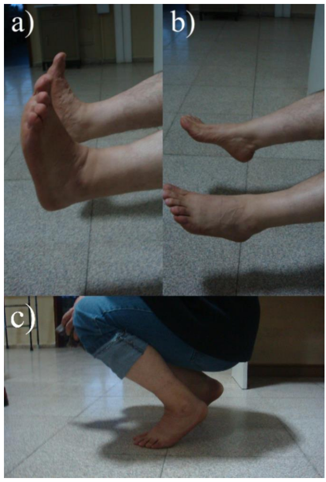
Fig. 3: At the third-year follow-up, the patient demonstrates a full range of motion in the ankle joint.