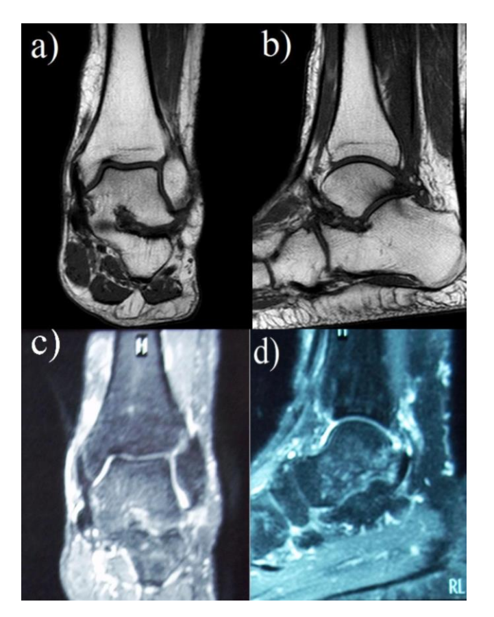
Fig. 2: Coronal (a), sagittal (b) T1-weighted and fat-suppressed proton density-weighted coronal (c) and sagittal (d) MRI images at the 3-year follow-up. Increased signal intensity consistent with bone marrow edema is observed in the ventral subchondral area of the talus and on the inferior surface adjacent to the calcaneus, more prominent on proton density-weighted sequences.